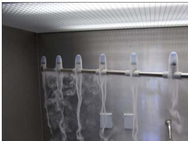
Aerosol distributing rake with outflowing aerosol