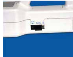
Easily Download Data to PC