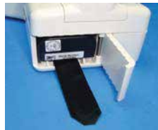
Removable Rechargeable Li-Ion Battery