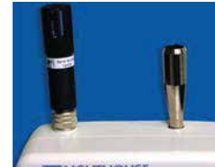
Removable Temp / RH and Isokinetic Probes