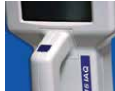
One-handed Operation with Start & Stop on Handle